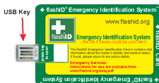
front (key extended)